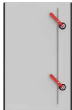
INSIDE OPTIONS FOR INSWING DOORS