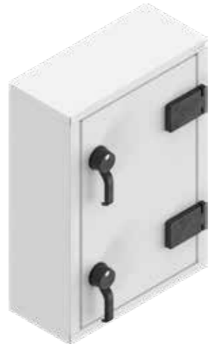
LATCH UNITS WITH HANDLES AND HINGES