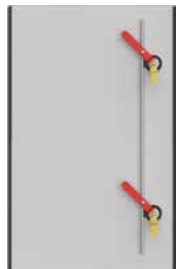
INSIDE OPTIONS FOR LATCH HINGES