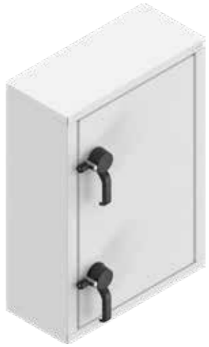
LATCH UNITS WITH HANDLES FOR INSWING DOORS