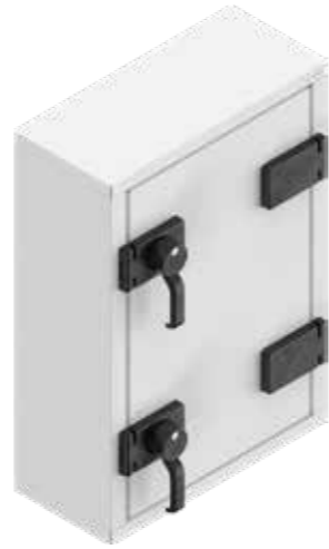
LATCH HINGES AND HINGES