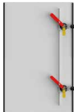
INSIDE OPTIONS FOR LATCH UNIT WITH HANDLE